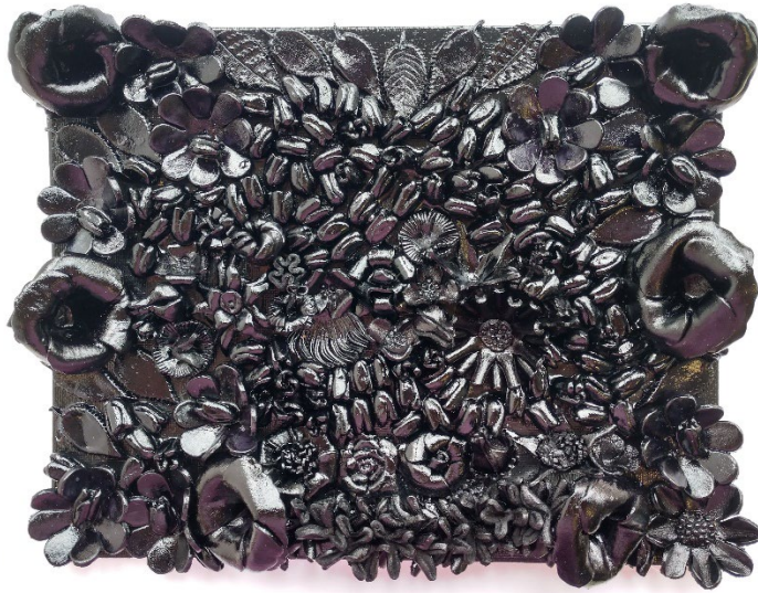
Untitled by Joe