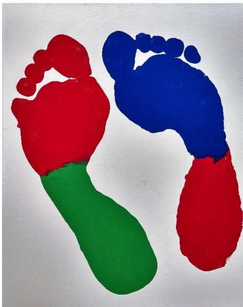
No soy de aqui, ni soy de alla. I am not from here, nor from there. by Goya

The exhibit seeks to illuminate viewpoints that have been historically lesser seen, and to support individual and collective community expression. Artwork by local K-8 students who participated in FOTM's Learning To See Outreach in-school art program will also be featured. There will be an opening reception open free to the public on Friday, October 14 from 4:30 p.m. – 6:30 p.m. in the main lobby of the Ventura County Government Center Hall of Administration.